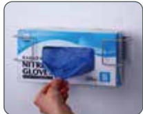
Glove box holder