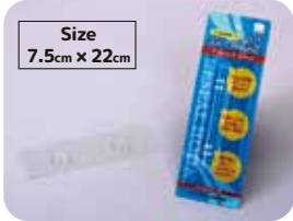
Size 7.5cm x 22cm For PPE products