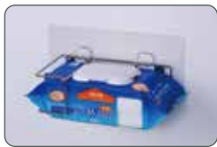
Disinfectant wipes pack holder