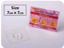
Size 7cm x 7cm For hand sanitizer and hand soap