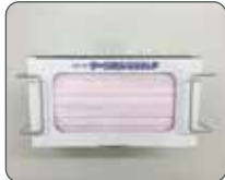
Mask box holder