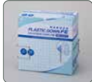
plastic gown box holder