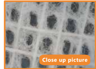
Close up picture

Hybrid fabric made of gauze and nonwoven fabric is being used.