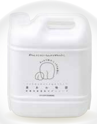
3.8L Refill bottle

%Do not use this product on mucous membrane.